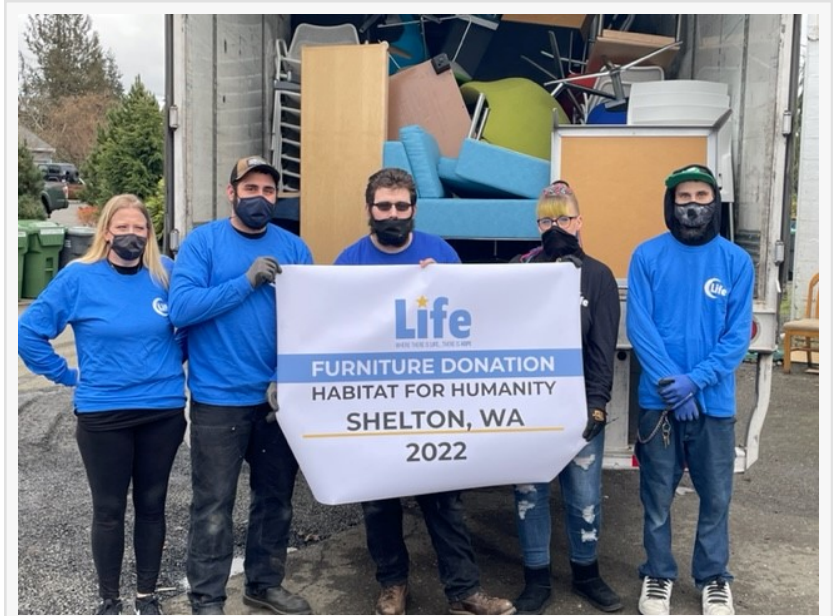
Volunteers getting ready to unload furniture

receives a donation of used furniture, frequently from schools or companies that are updating their furnishings and then LIFE ensures its careful and precise distribution to not-for-profits. These not-for-profit organizations either use it to benefit their program and cover the costs of their programming or distribute to people in need.